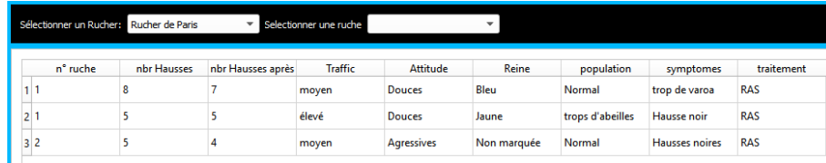
Fig. 4. Screenshot of the ApiSoft application: list of data for beehives

The figure 4 shows the data for all the beehives ( ruche ) of an apiary ( Rucher ). Different data are shown like the Traffic, the attitude, if the queen ( Reine ) are marked, if the beekeeper saw some symptoms and if the beehive received a treatment ( Traitement ).