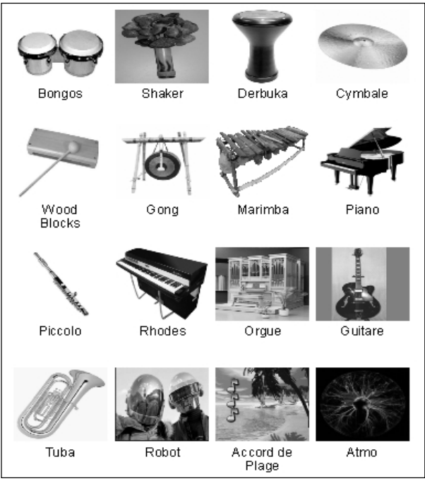
Figure 3. MIDI page of the instrument booklet

Unlike the first experiment, our system is given the exact same status as the usual instruments. This way we could see whether the children would still use the Wiimote system or revert to the standard instruments. Also, restricting the patients to only one instrument prevents them from being overwhelmed by the excitement induced by too large a choice.